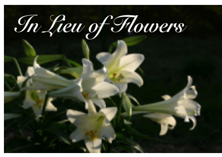
The following donations have been received with appreciation by St. James Armenian Apostolic Church. May God bless the souls of our dearly departed and give comfort and hope to their families.