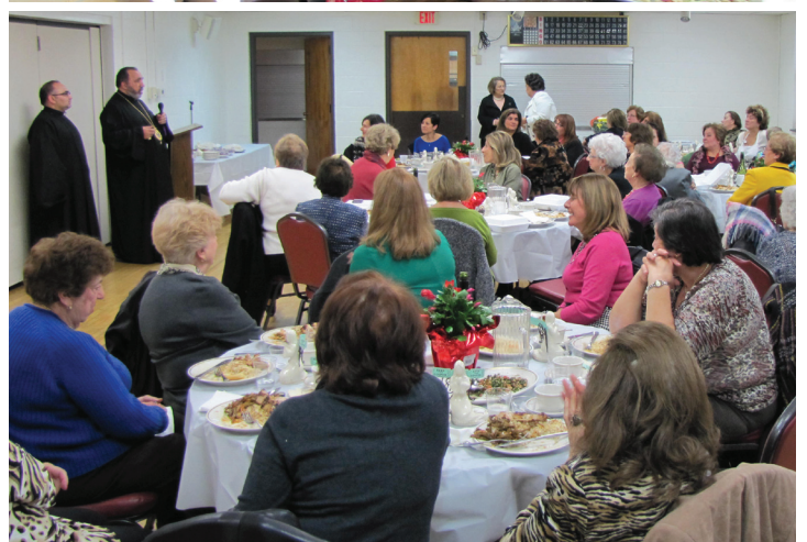
Top and middle: Women's Guild members prepare for the Annual Bazaar.