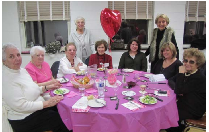
Women's Guild members celebrate Valentine's Day in February 2012.