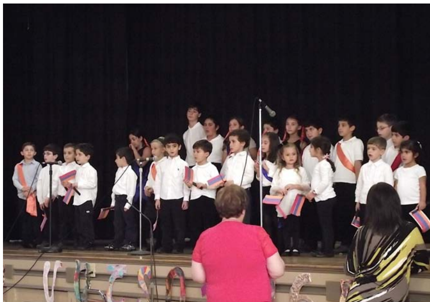
During the annual fundraising banquet, on Sunday, November 4, students presented a cultural program on the occasion of the 1650th anniversary of Mesrob Mashdotz' birth.