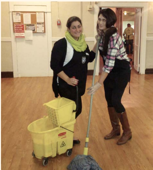
ACYOA members volunteer at the Boston Rescue Mission.