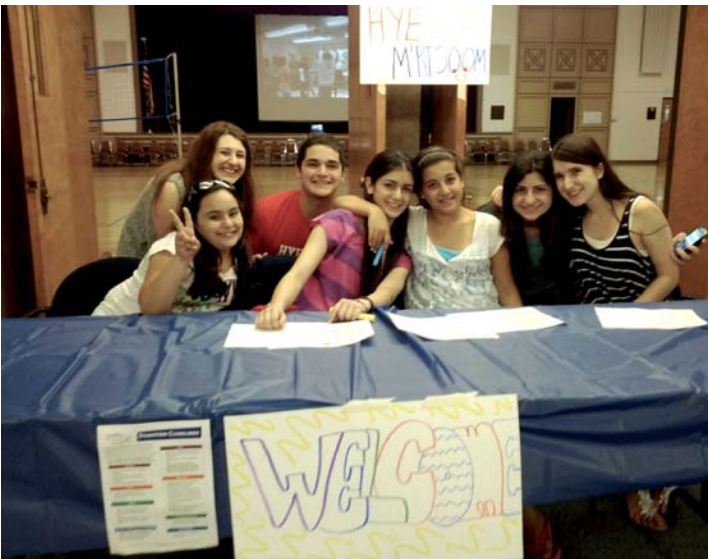
Hye M'rtsoom participants prepare for a game.