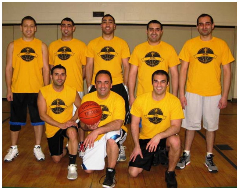
The St. James Armenian Church Basketball League team.