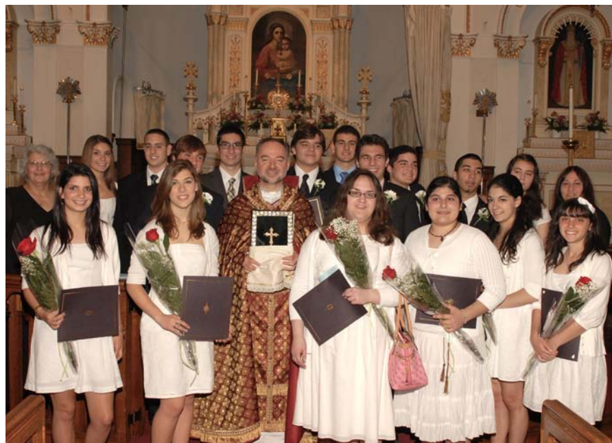
Sunday School graduates pose for a group photo in the sanctuary.