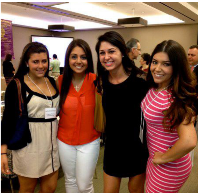
St. James delegates at the ACYOA General Assembly.

The ACBL planning committee is planning for another season this winter. Thank you to all volunteers, players, and organizers who helped make this season possible.