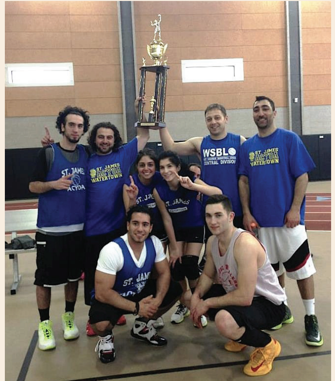
Top: The volleyball team after winning the championship trophy in Providence.

We had an exciting spring season, and we look forward to welcoming the 2013 high school graduates to the ACYOA Seniors in the fall!