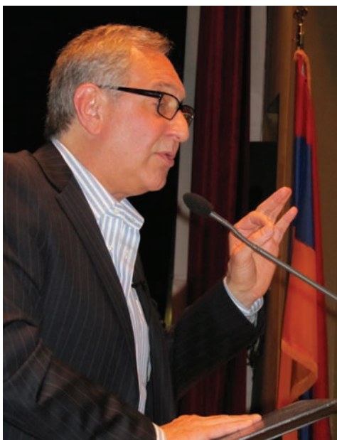
Mark Geragos speaks at St. James Church.