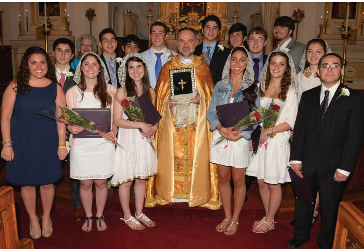
At left: Members of the graduating class in the sanctuary.

Sunday School resumes on September 15. Join us for HOMECOMING SUNDAY.