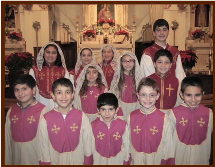
Armenian School students.

On February 3, the school hosted the annual Vartanantz celebration, serving a traditional meal of harissa along with other delicacies. A special program prepared by the students followed the luncheon, featuring songs, dances, and poems to commemorate the Feast of Sts. Vartanantz.