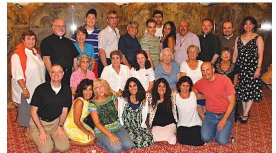
Participants on the 2009 Pilgrimage to the Holy Land of Jerusalem.