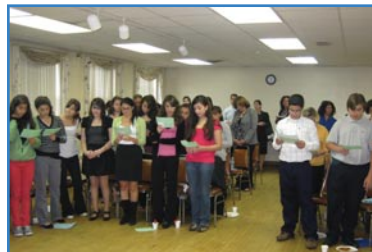
ACYOA Juniors General Meeting