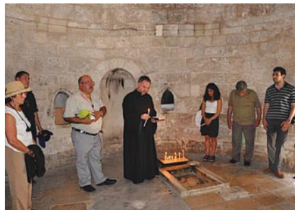
Group prayer at holy site.