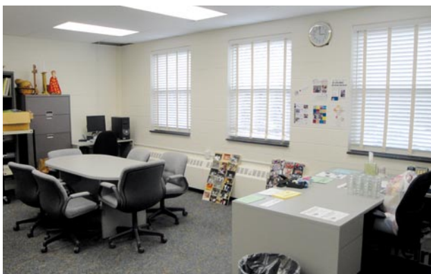
Newly renovated Youth Office

This summer also saw the renovation of the Youth Office. The Youth Office has been renovated and received a technology upgrade to serve as a fully-functioning office to support the work of our full-time Youth Minister, as well as our Sunday School and youth.